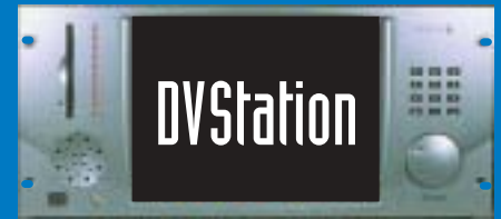
DVStation: Advanced Monitoring for Digital Networks